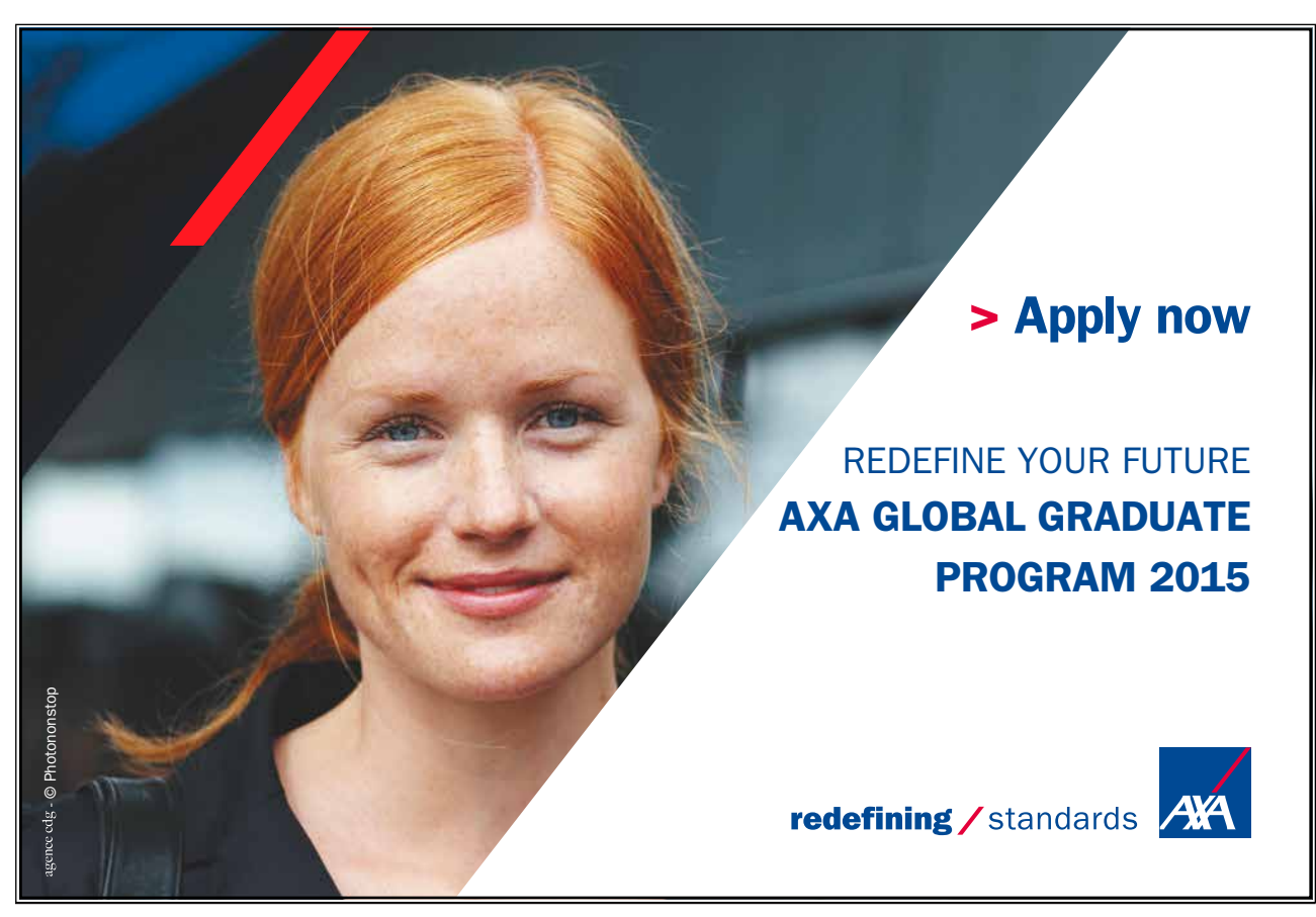
Download free eBooks at bookboon.com

notion of closing the accounts becomes far less relevant. Very simply, the computer can mine all transaction data and pull out the accounts and amounts that relate to virtually any requested interval of time.